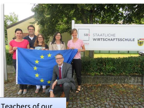
Teachers of our Erasmus Team, 2019