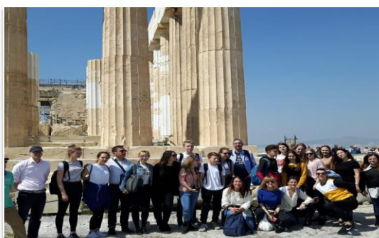
Visiting the Acropolis in Athens, 2019

Every year the students of the 9th form spend a week at English language schools in Sussex or Kent.