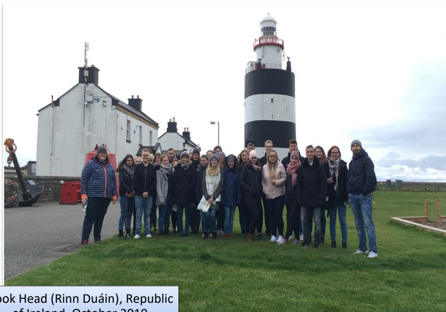
Hook Head (Rinn Duáin), Republic of Ireland, October 2019

We send groups of students to work as interns in Irish companies for a fortnight every year.